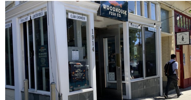
WOODHOUSE FISH CO