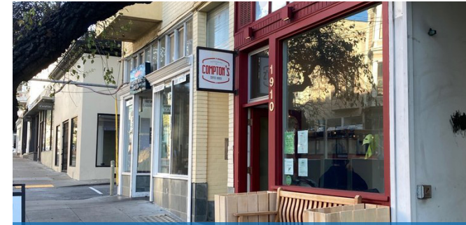
COMPTON'S COFFEE HOUSE