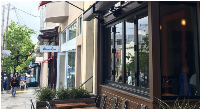
ROAM ARTISAN BURGERS