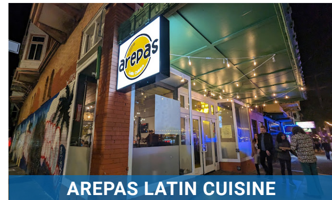
AREPAS LATIN CUISINE