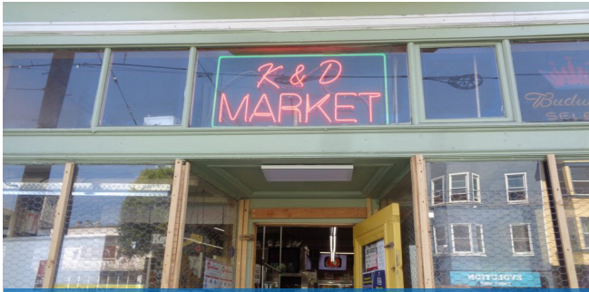
K & D MARKET AND KOREAN BBQ