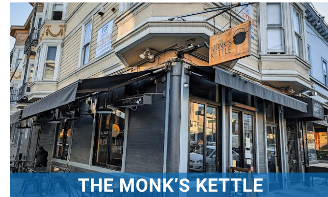
THE MONK'S KETTLE