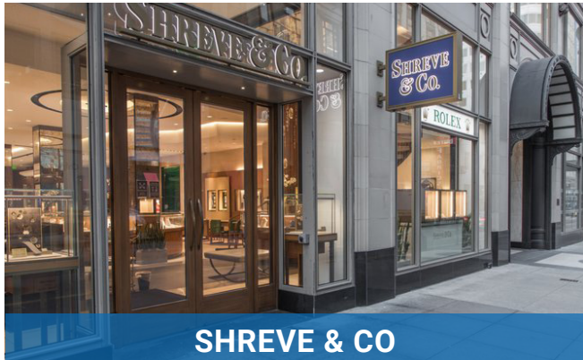
SHREVE & CO