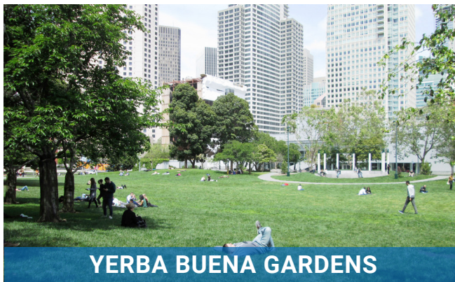
YERBA BUENA GARDENS