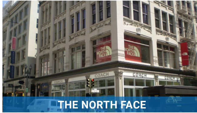
THE NORTH FACE