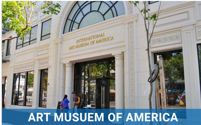
ART MUSEUM OF AMERICA