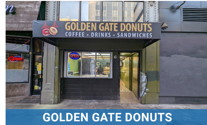
GOLDEN GATE DONUTS