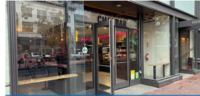
DAVID RIO CHAI BAR