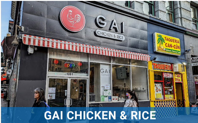
GAI CHICKEN & RICE