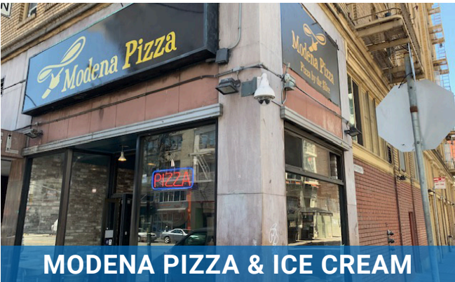
MODENA PIZZA & ICE CREAM