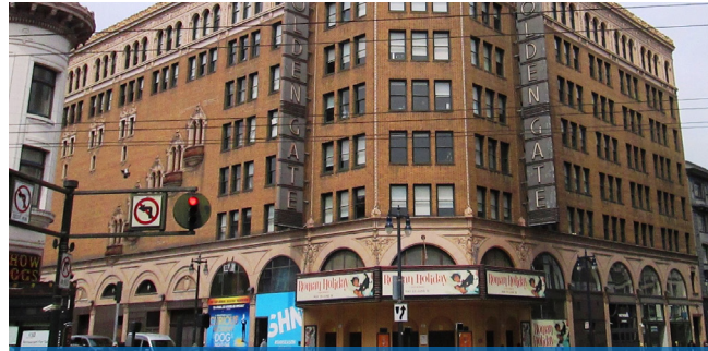
GOLDEN GATE THEATRE