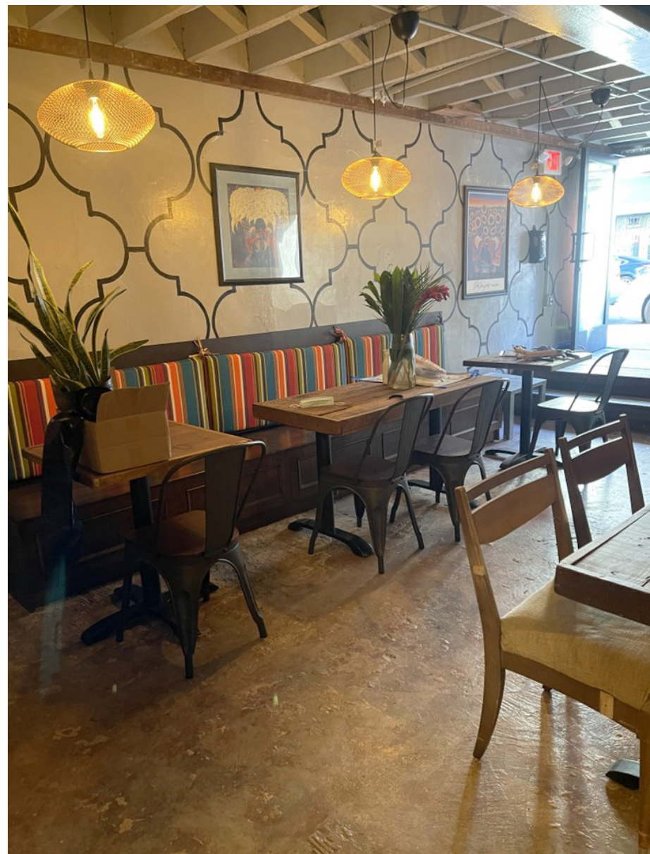
*Photo is not current taken and does not represent the current condition of the space.

Don't Miss Out on this Superb Opportunity!