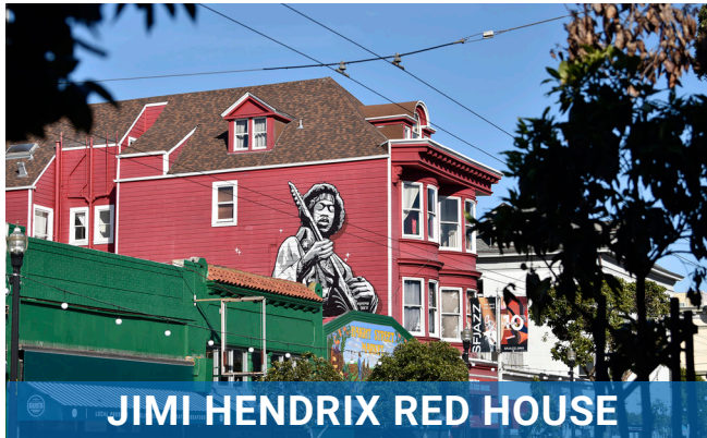
JIMI HENDRIX RED HOUSE