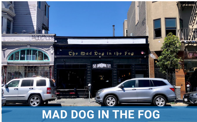
MAD DOG IN THE FOG