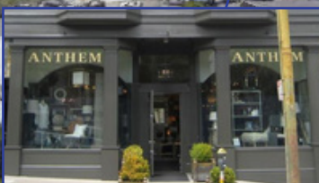
Anthem Bed & Bath