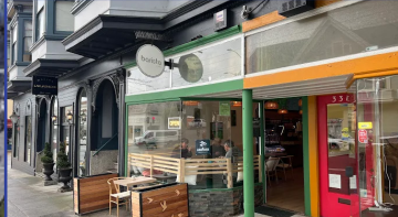
Barista Coffee & Brunch