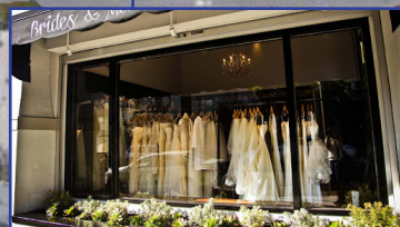
And Something Blue