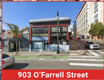
903 O'Farrell Street