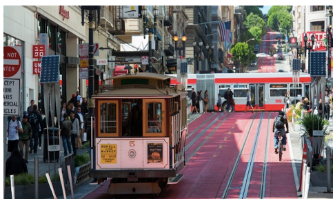
POWELL CABLE CAR LINE