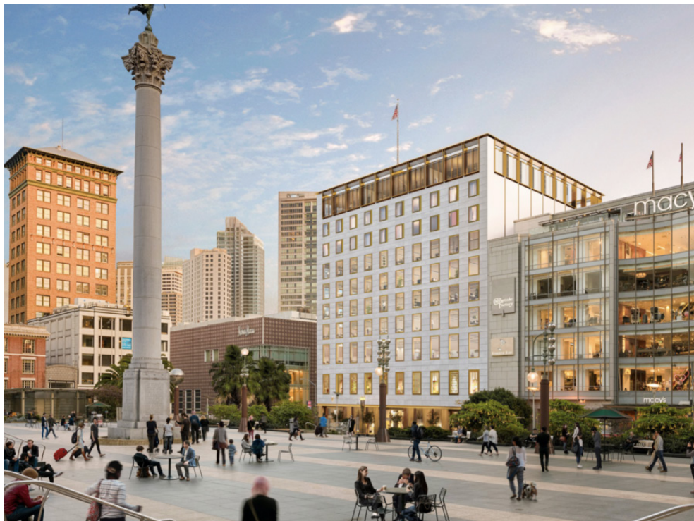
UNION SQUARE | THE VIBRANT HEART OF SAN FRANCISCO

Grand Hyatt Hotel, Marriot Hotel, Saks Fifth Avenue, Apple and many well-known tenants are all situated nearby.