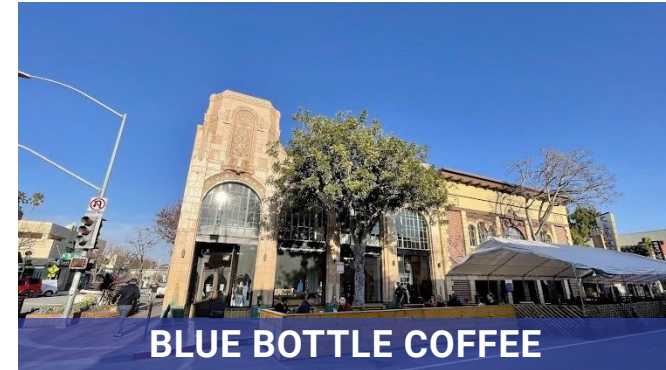
BLUE BOTTLE COFFEE