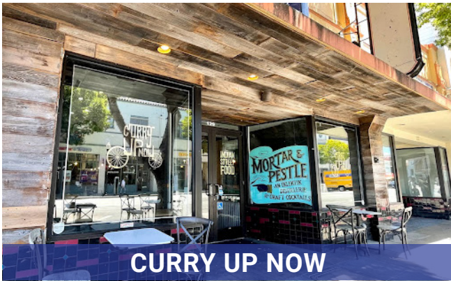
CURRY UP NOW