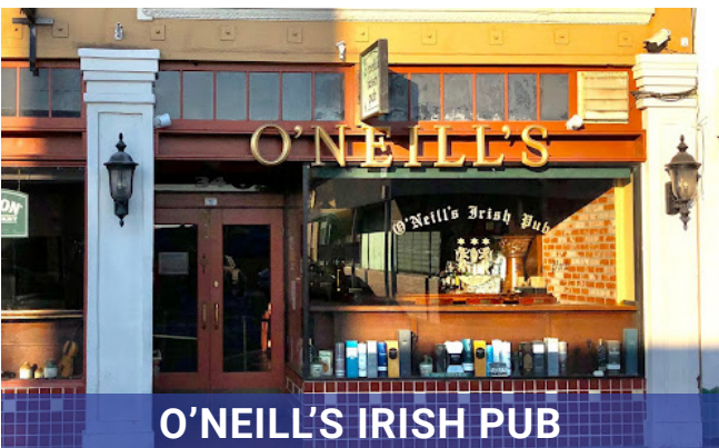
O'NEILL'S IRISH PUB