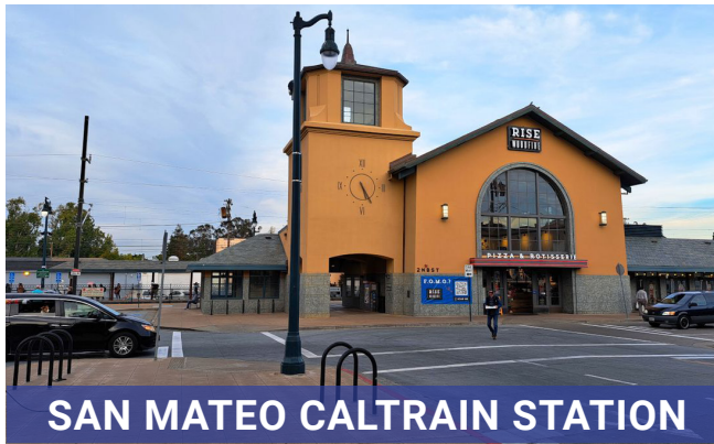
SAN MATEO CALTRAIN STATION