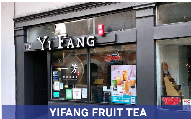
YIFANG FRUIT TEA