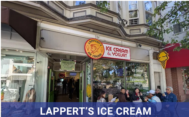
LAPPERT'S ICE CREAM