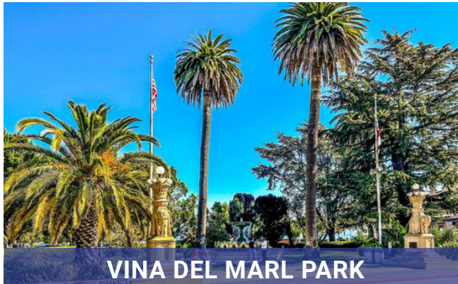
VINA DEL MAR PARK