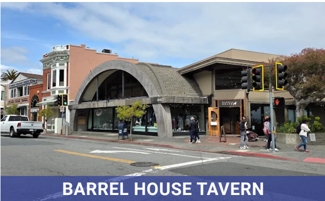
BARREL HOUSE TAVERN