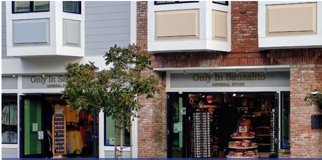
ONLY IN SAUSALITO