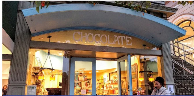
ATALIA GELATO AND CHOCOLATE