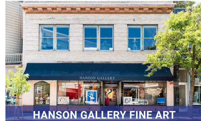
HANSON GALLERY FINE ART