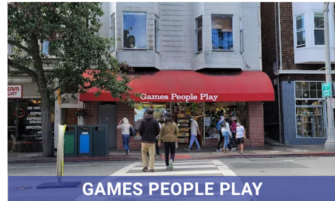
GAMES PEOPLE PLAY