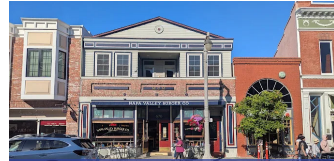
NAPA VALLEY BURGER COMPANY