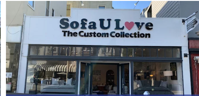
SOFA U LOVE