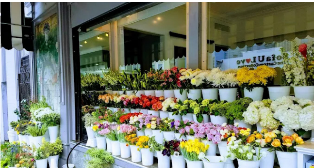
THE BUD STOP