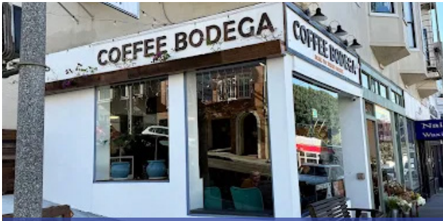
COFFEE BODEGA FARM-TO-TABLE