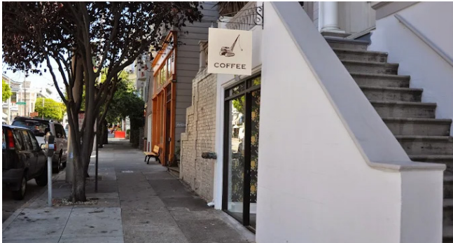
WRECKING BALL COFFEE