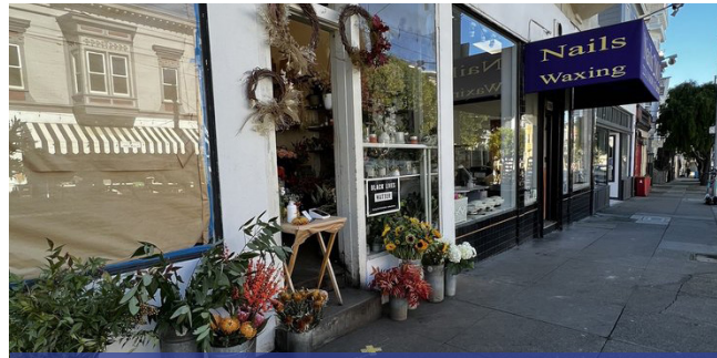
LE BOUQUET FLOWER SHOP