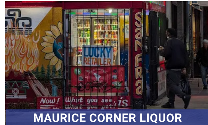
MAURICE CORNER LIQUOR