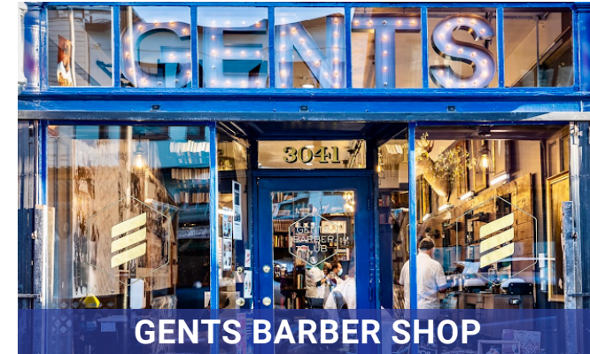
GENTS BARBER SHOP