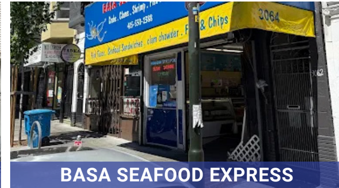
BASA SEAFOOD EXPRESS