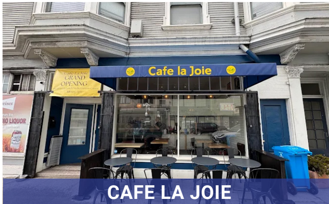
CAFE LA JOIE