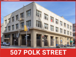
507 POLK STREET