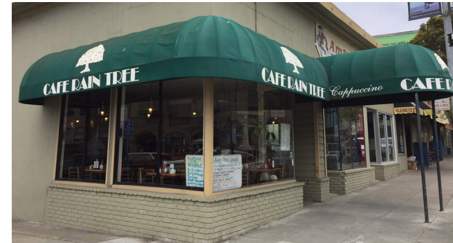
CAFE RAIN TREE