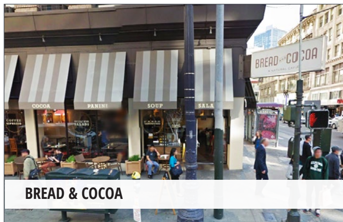
BREAD & COCOA