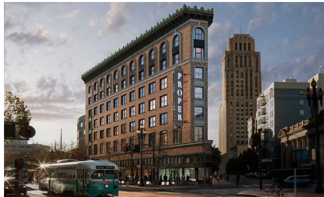
SAN FRANCISCO PROPER