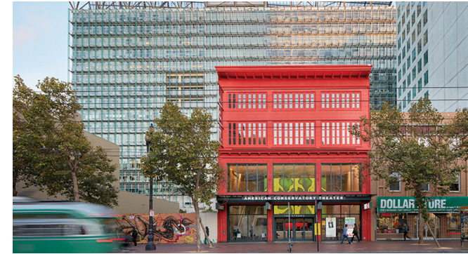
AMERICAN CONSERVATORY THEATER