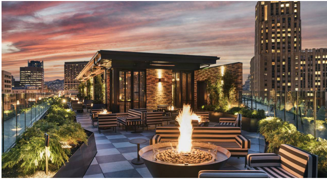
CHARMAINE'S ROOFTOP LOUNGE