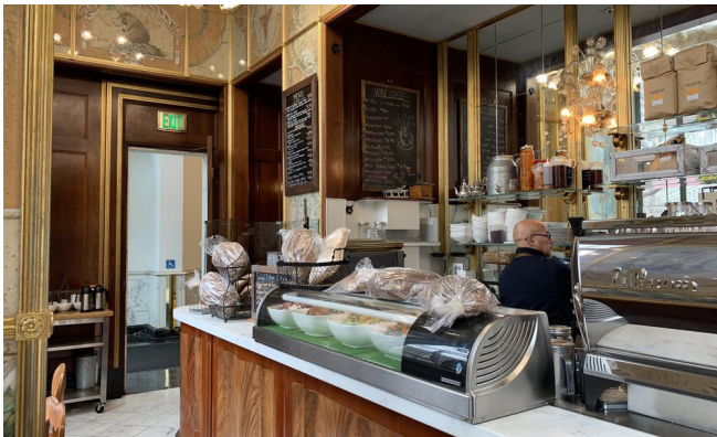
LA CUISINE CAFE