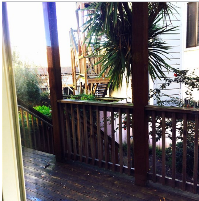
View of back deck