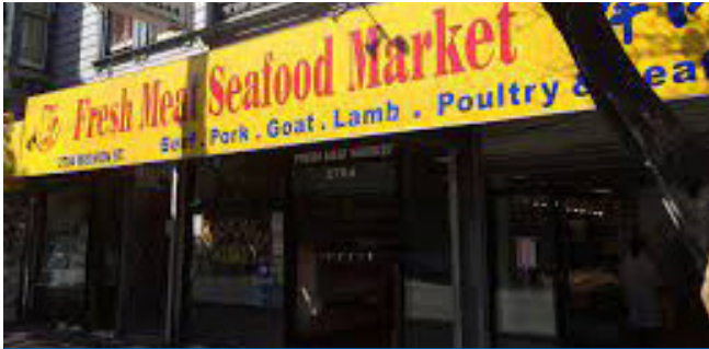
FRESH MEAT SEAFOOD MARKET