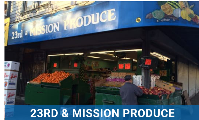
23RD & MISSION PRODUCE