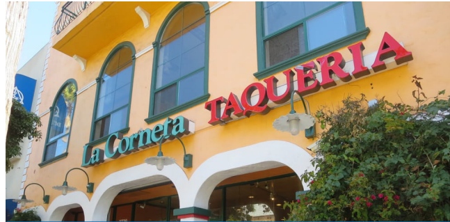
LA CORNETA TAQUERIA