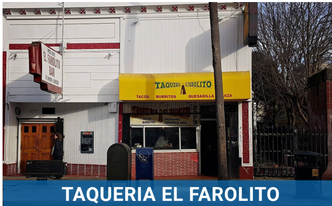
TAQUERIA EL FAROLITO