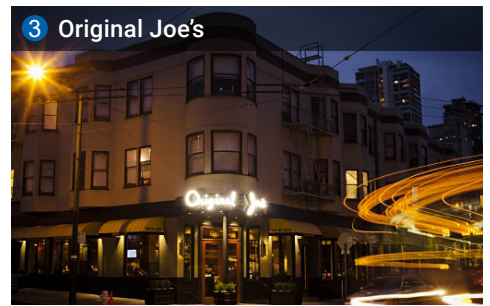
3 Original Joe's