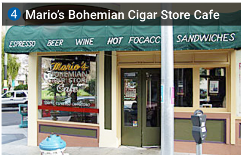
4 Mario's Bohemian Cigar Store Cafe