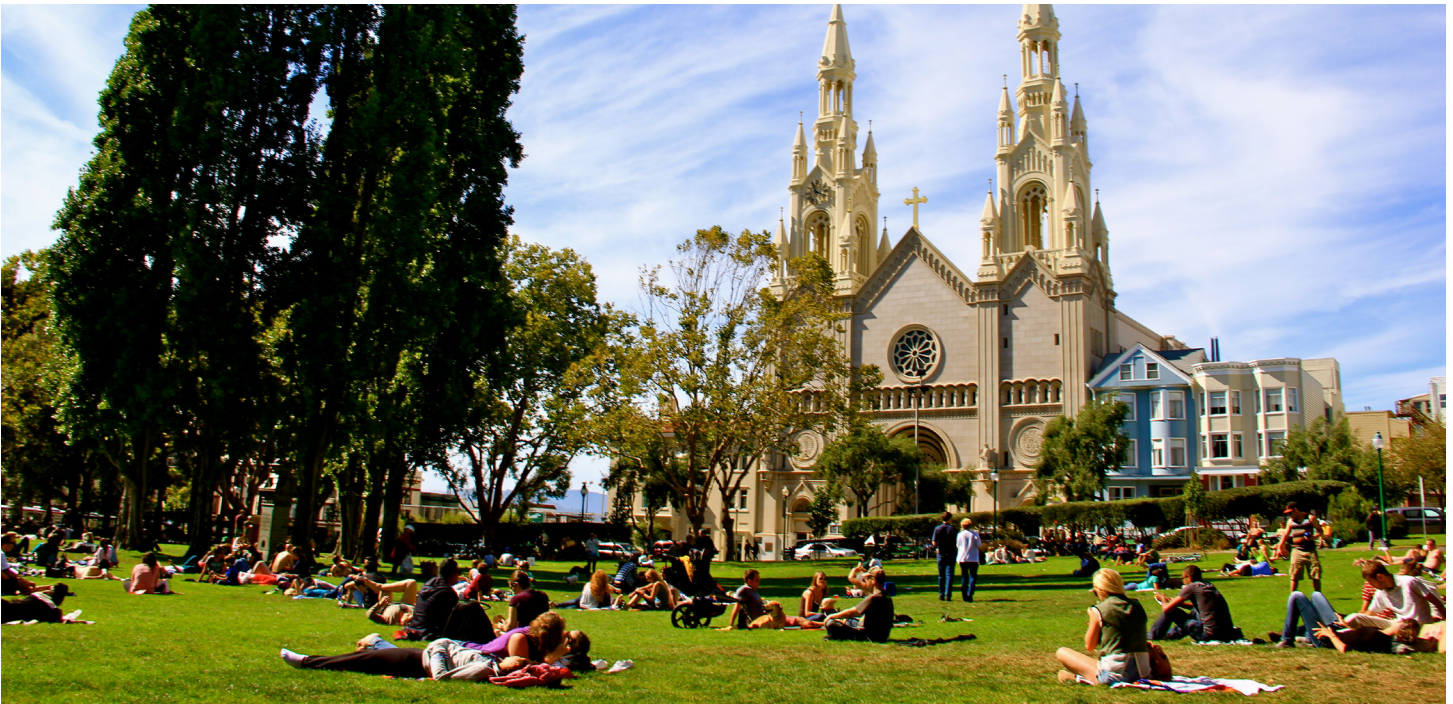
Popular Washington Square Park Located 1/2