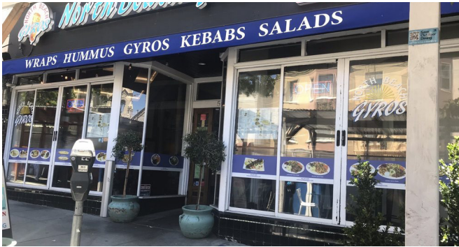
NORTH BEACH GYROS