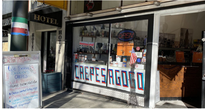
CREPES A GO GO