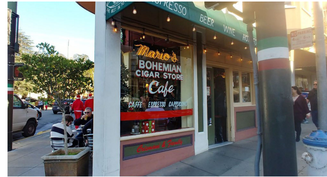
MARIO'S BOHEMIAN CAFE