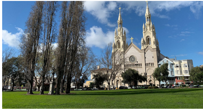
WASHINGTON SQUARE PARK