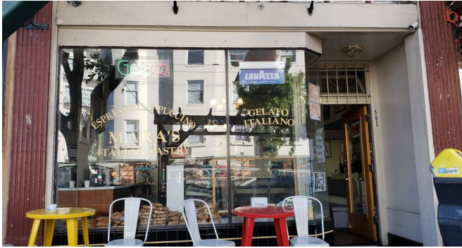
MARA'S ITALIAN PASTRIES