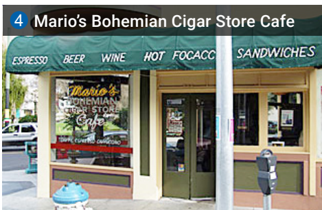
4 Mario's Bohemian Cigar Store Cafe