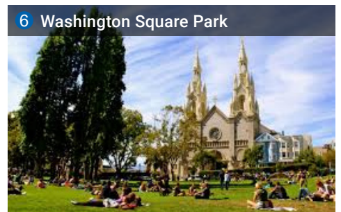
6 Washington Square Park