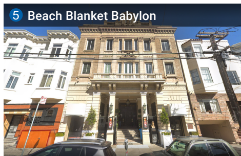
5 Beach Blanket Babylon