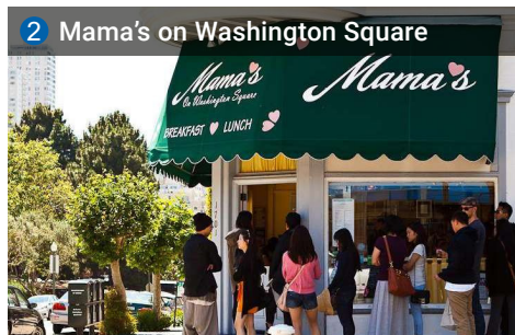
2 Mama's on Washington Square