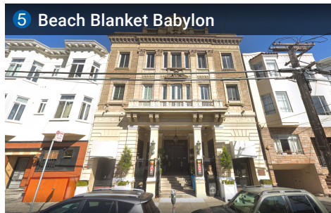
5 Beach Blanket Babylon