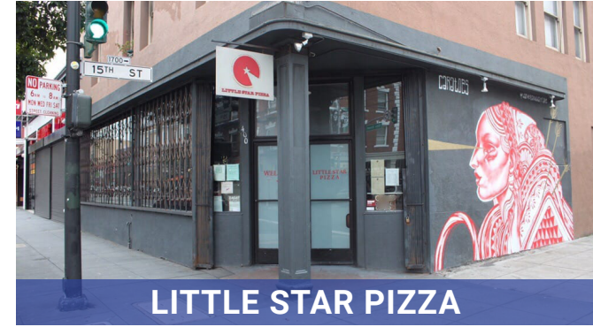
LITTLE STAR PIZZA