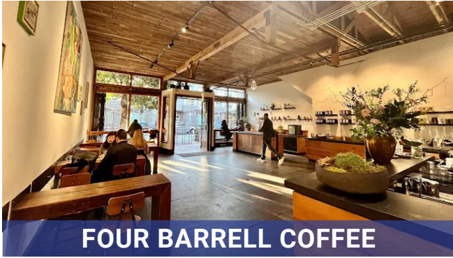
FOUR BARRELL COFFEE