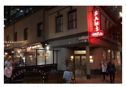
SAM'S GRILL & SEAFOOD