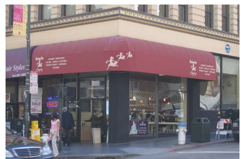
WORKING GIRLS' CAFE