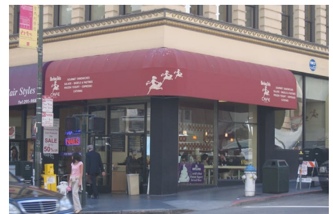
WORKING GIRLS' CAFE