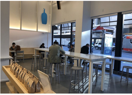
BLUE BOTTLE COFFEE