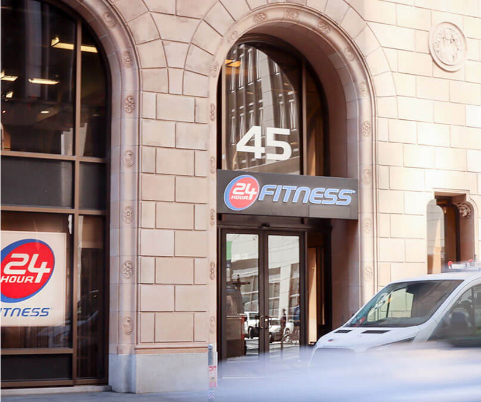
24 HOUR FITNESS