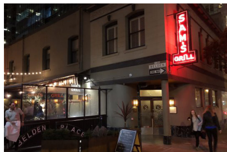
SAM'S GRILL & SEAFOOD