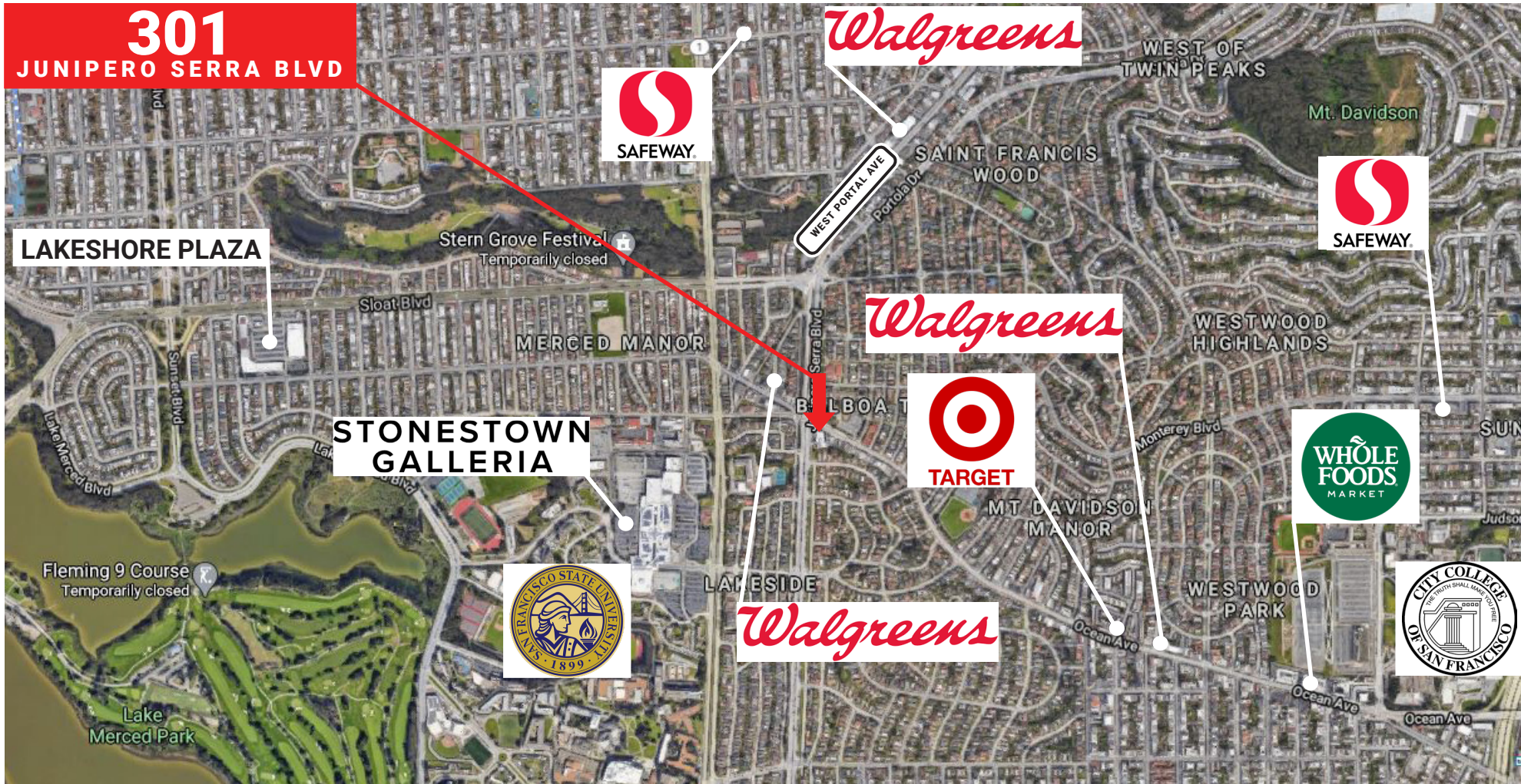
Aerial View of 301 Junipero Serra Blvd, San Francisco, CA 94127