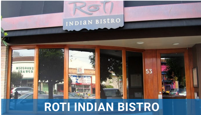
ROTI INDIAN BISTRO