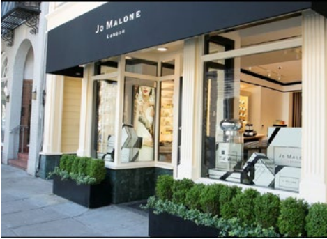
JO MALONE LONDON