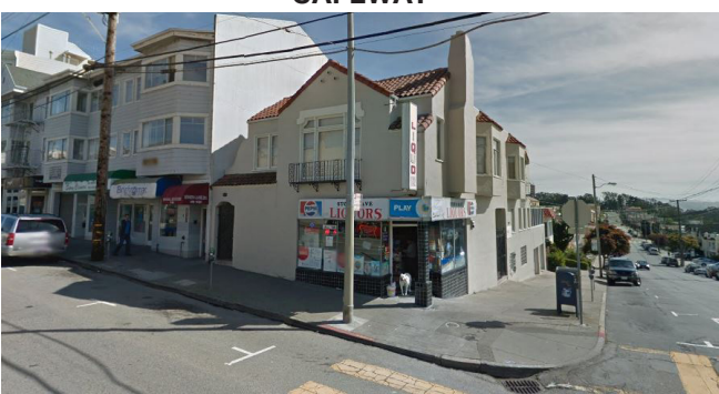
STOP & SAVE LIQUOR