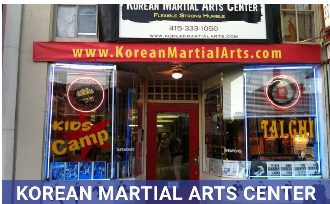
KOREAN MARTIAL ARTS CENTER