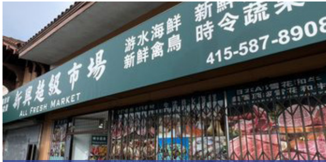
ALL FRESH MARKET