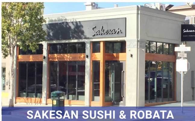
SAKESAN SUSHI & ROBATA