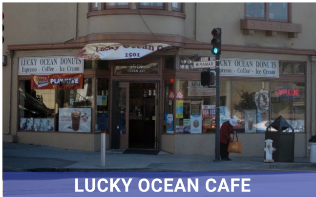
LUCKY OCEAN CAFE