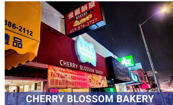
CHERRY BLOSSOM BAKERY