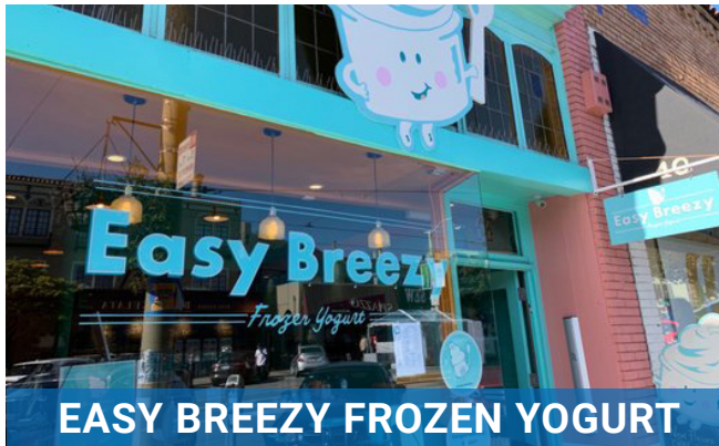
EASY BREEZY FROZEN YOGURT