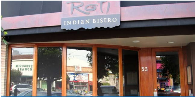
ROTI INDIAN BISTRO