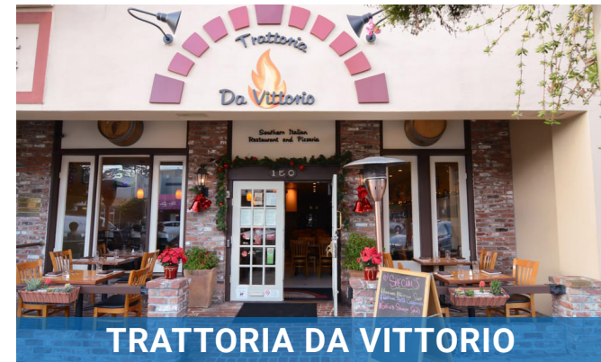
TRATTORIA DA VITTORIO