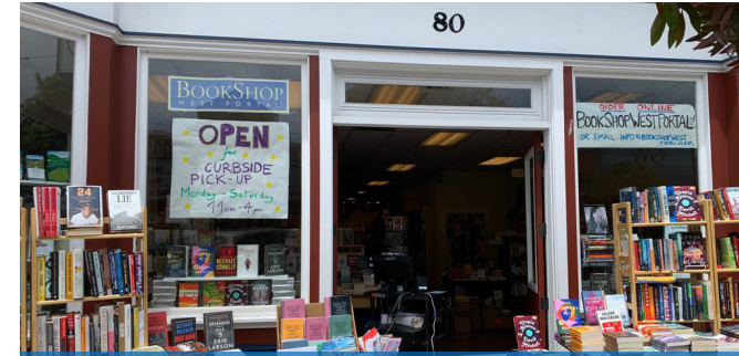
BOOKSHOP WEST PORTAL