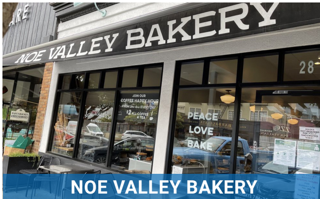
NOE VALLEY BAKERY