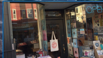
Groove Merchant Records