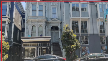
631 Haight Street