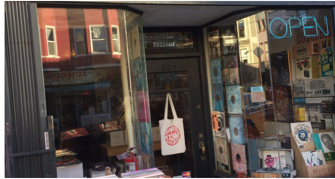
GROOVE MERCHANT RECORDS