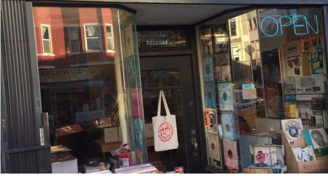
GROOVE MERCHANT RECORDS