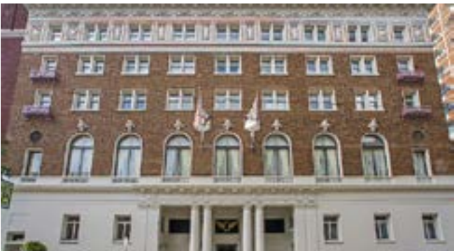
THE OLYMPIC CLUB