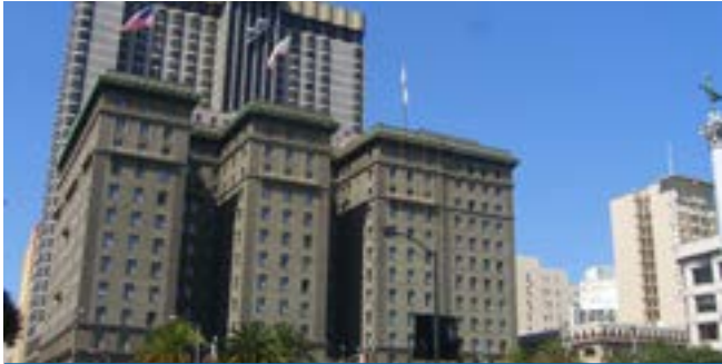
WESTIN ST. FRANCIS