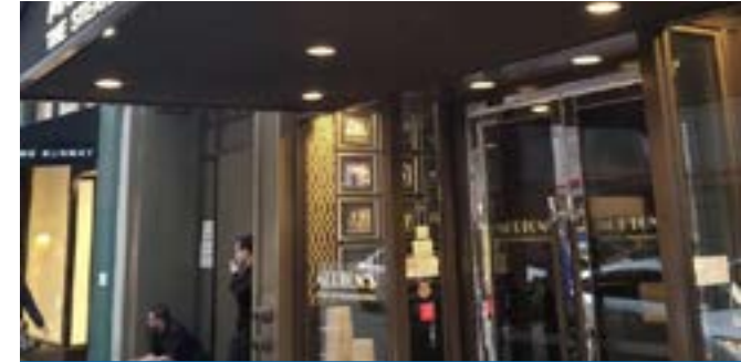
MORTON'S THE STEAKHOUSE