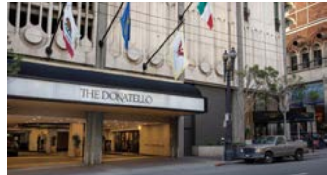
THE DONATELLO HOTEL