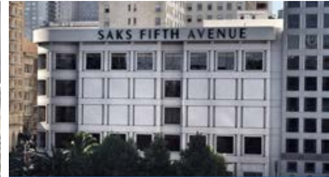
SAKS FIFTH AVENUE