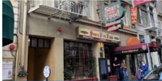
SEARS FINE FOOD