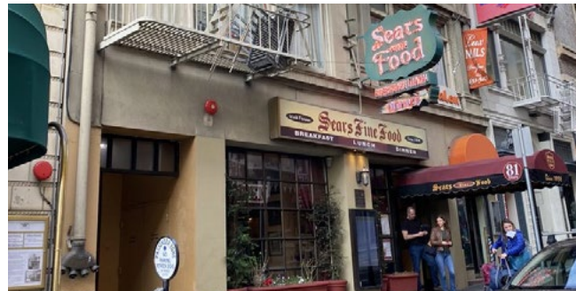
SEARS FINE FOOD