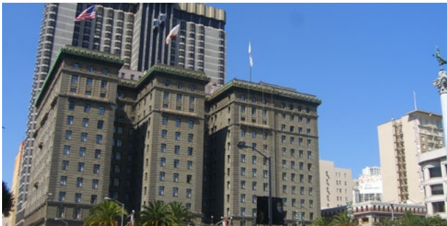
WESTIN ST. FRANCIS