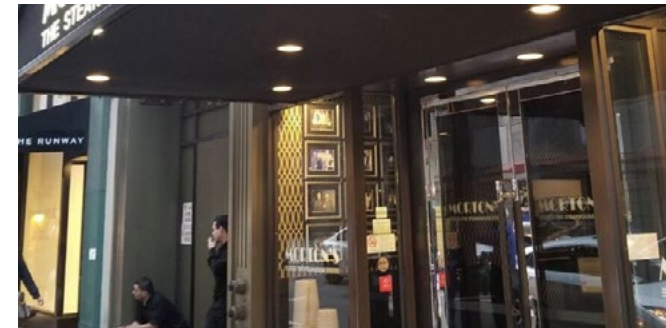
MORTON'S THE STEAKHOUSE