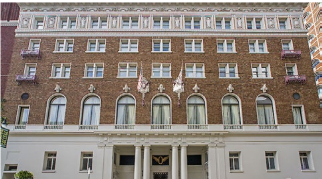
THE OLYMPIC CLUB