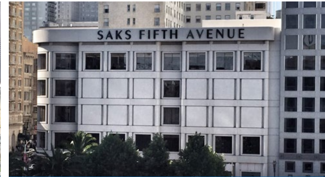
SAKS FIFTH AVENUE