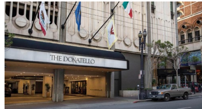
THE DONATELLO HOTEL