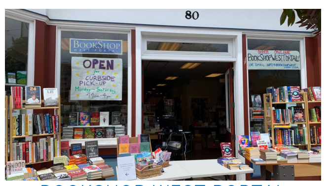
BOOKSHOP WEST PORTAL