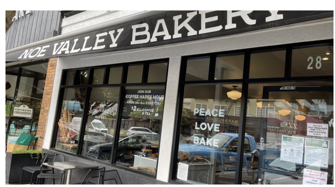
NOE VALLEY BAKERY